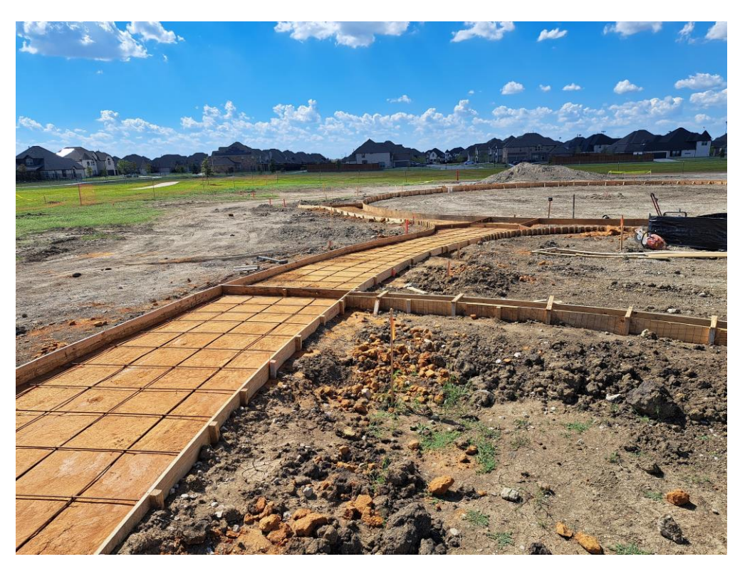
Tanners Mill Park