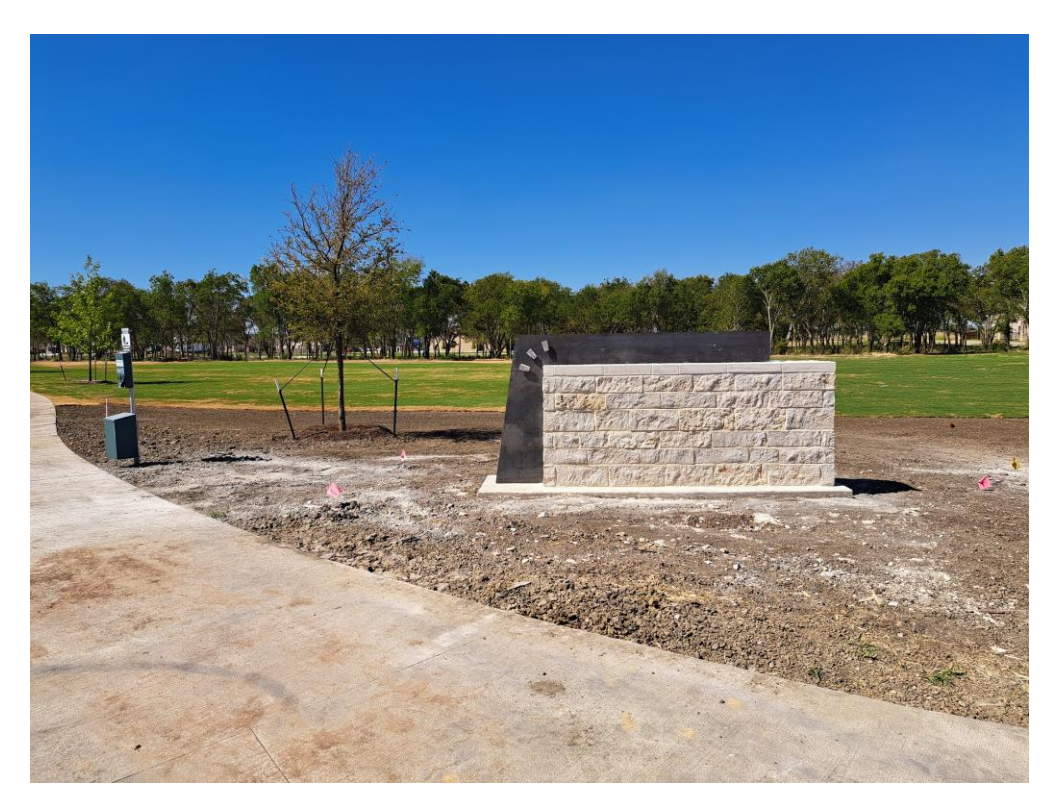
Star Meadow Park